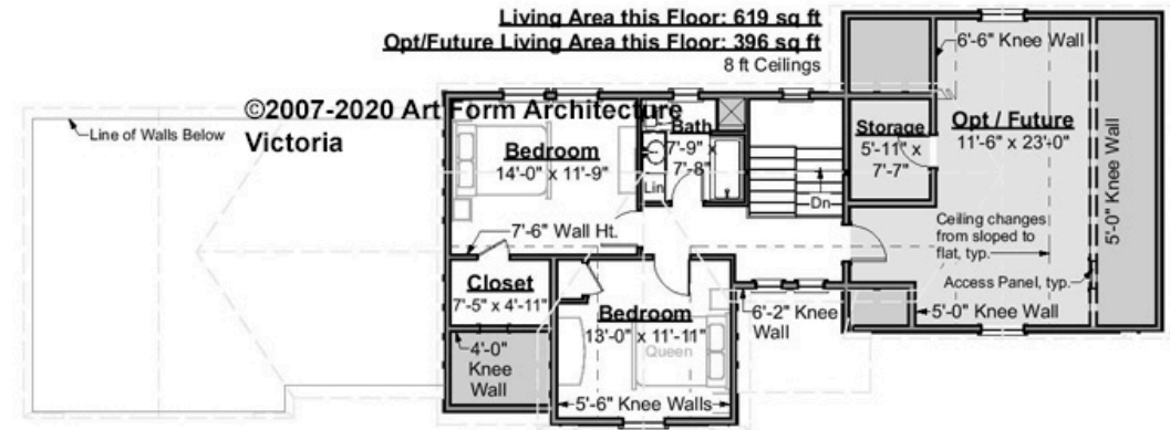
CRS 040.127.v5 GR Victoria

Some features shown are optional. Your Purchase & Sale Agreement governs, whether items are labeled "optional" in this document or not.