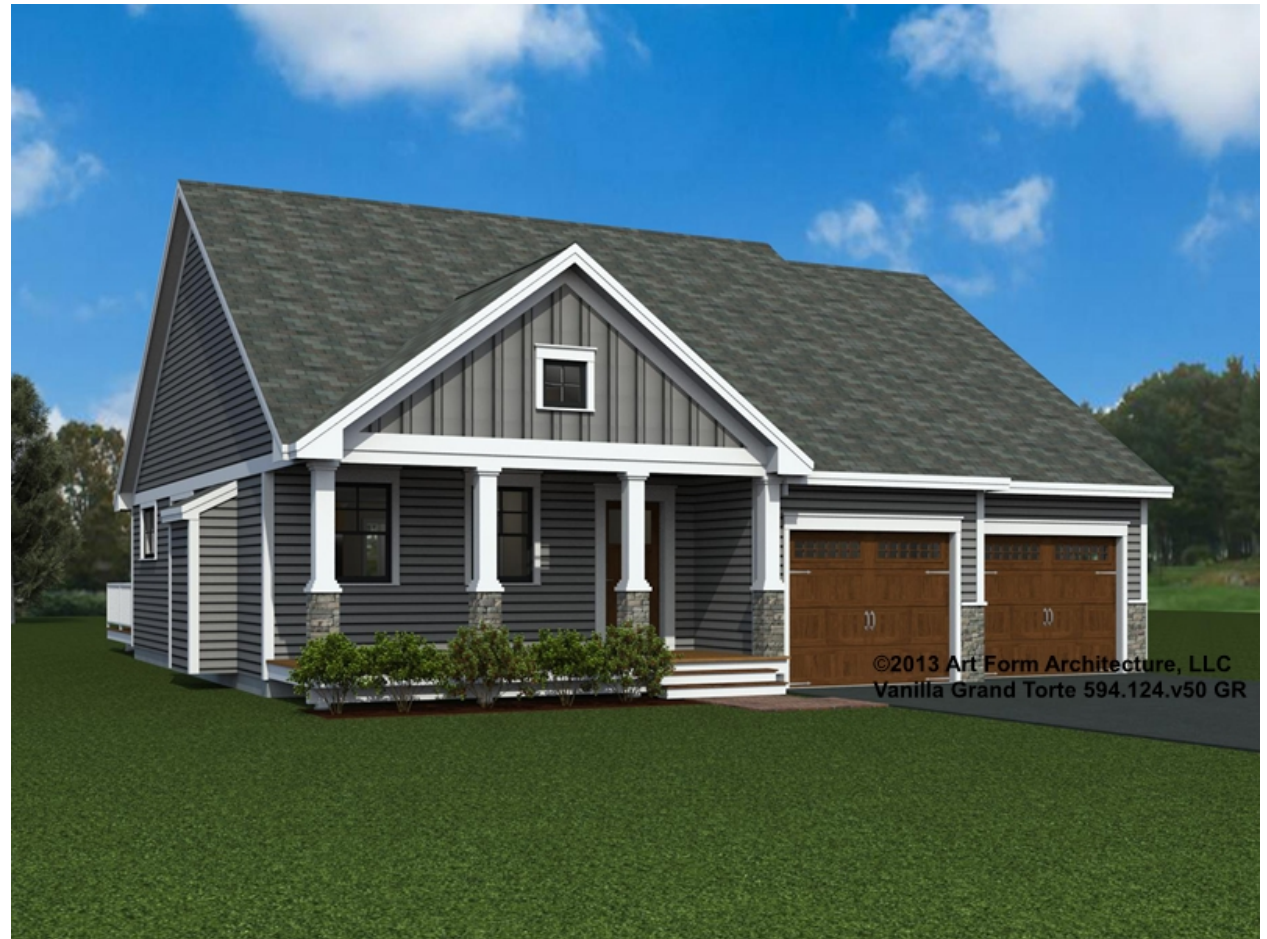
©2013 Art Form Architecture, LLC Vanilla Grand Torte 594.124.v50 GR

Art Form Architecture, LLC ("Artform") requires that our Drawings be built substantially as designed. Artform will not be obligated by or liable for use of this design with markups as part of any builder agreement. While we attempt to accommodate where possible and reasonable, and where the changes do not denigrate our design, any and all changes to Drawings must be approved in writing by Artform. It is recommended that you have your Drawing updated by Artform prior to attaching any Drawing to any builder agreement. Artform shall not be responsible for the misuse of or unauthorized alterations to any of its Drawings.