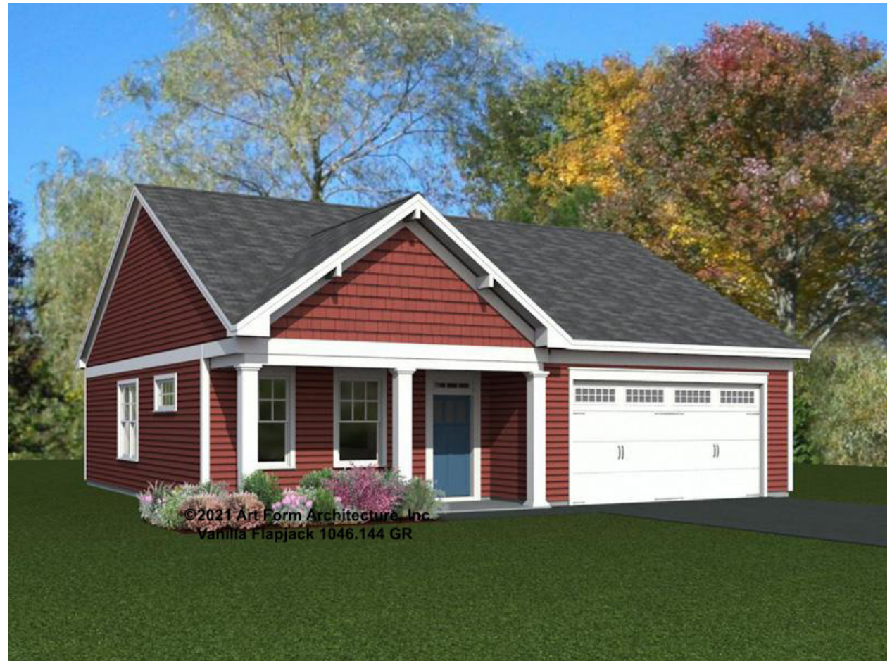
©2021 Art Form Architecture, Inc. Vanilla Flapjack 1046.144 GR

Art Form Architecture, LLC ("Artform") requires that our Drawings be built substantially as designed. Artform will not be obligated by or liable for use of this design with markups as part of any builder agreement. While we attempt to accommodate where possible and reasonable, and where the changes do not denigrate our design, any and all changes to Drawings must be approved in writing by Artform. It is recommended that you have your Drawing updated by Artform prior to attaching any Drawing to any builder agreement. Artform shall not be responsible for the misuse of or unauthorized alterations to any of its Drawings.