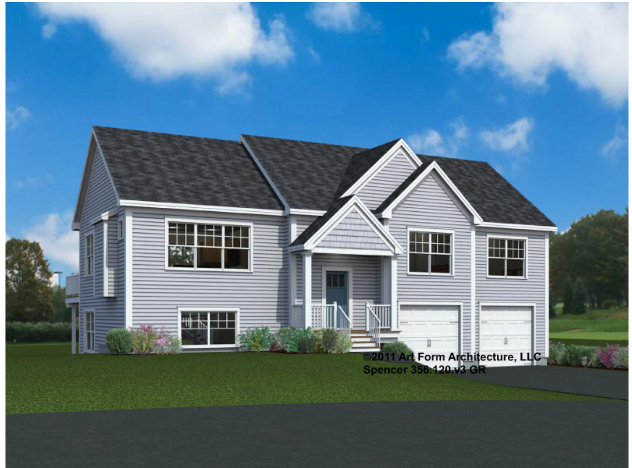
Spencer 356.120.v3 GR

Art Form Architecture, LLC ("Artform") requires that our Drawings be built substantially as designed. Artform will not be obligated by or liable for use of this design with markups as part of any builder agreement. While we attempt to accommodate where possible and reasonable, and where the changes do not denigrate our design, any and all changes to Drawings must be approved in writing by Artform. It is recommended that you have your Drawing updated by Artform prior to attaching any Drawing to any builder agreement. Artform shall not be responsible for the misuse of or unauthorized alterations to any of its Drawings.