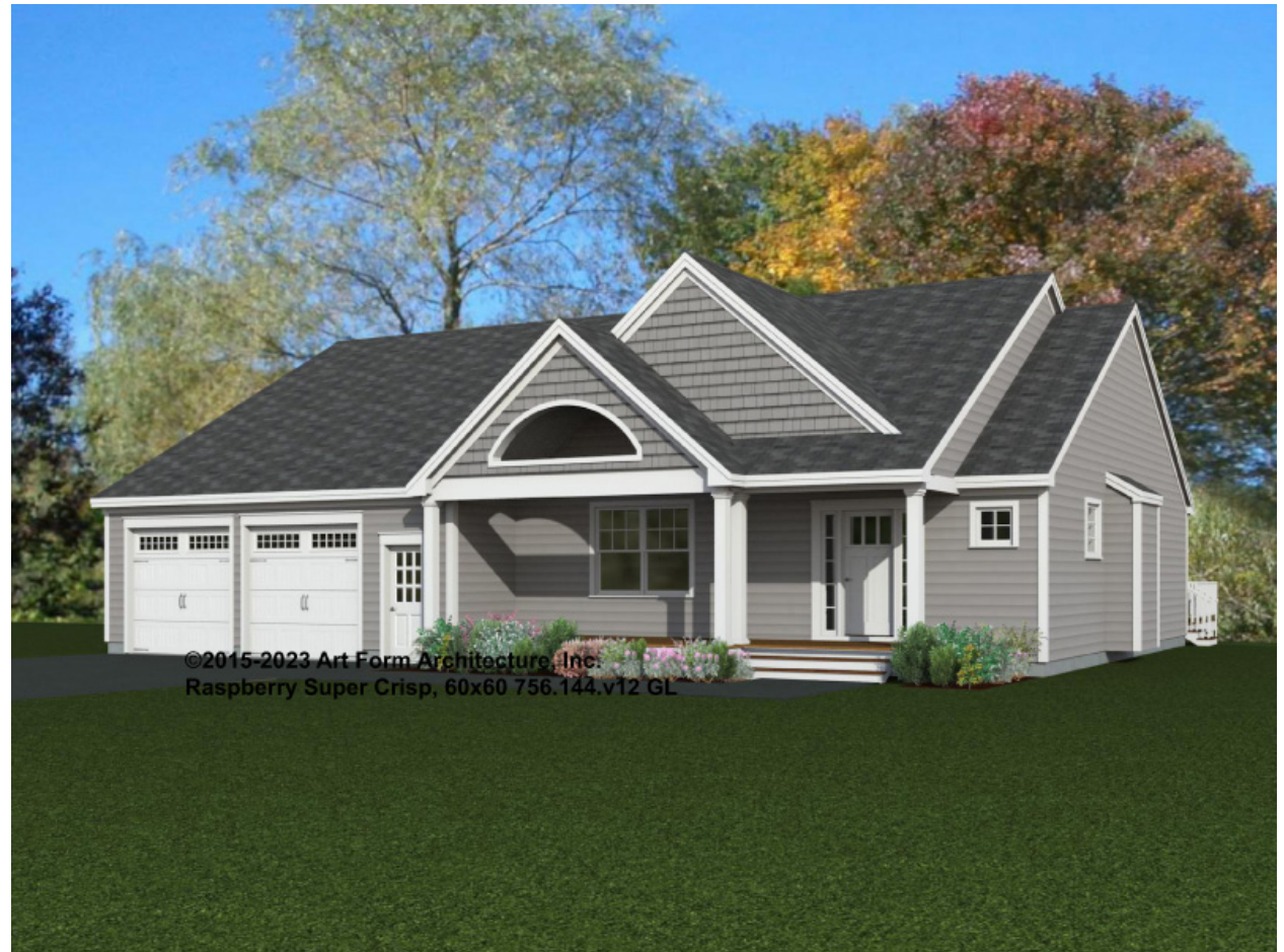
©2015-2023 Art Form Architecture, Inc. Raspberry Super Crisp, 60x60 756.144.v12 GL

Art Form Architecture, LLC ("Artform") requires that our Drawings be built substantially as designed. Artform will not be obligated by or liable for use of this design with markups as part of any builder agreement. While we attempt to accommodate where possible and reasonable, and where the changes do not denigrate our design, any and all changes to Drawings must be approved in writing by Artform. It is recommended that you have your Drawing updated by Artform prior to attaching any Drawing to any builder agreement. Artform shall not be responsible for the misuse of or unauthorized alterations to any of its Drawings.