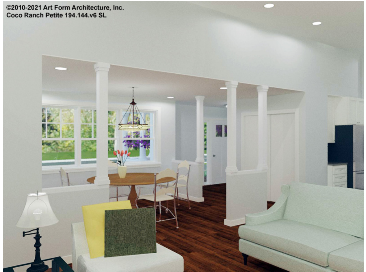
Living & Dining - Additional Image

©2010-2021 Art Form Architecture, Inc. Coco Ranch Petite 194.144.v6 SL