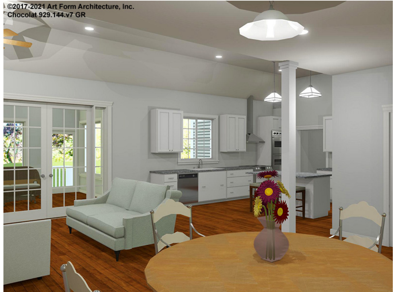
Living & Kitchen - Additional Image

Some features shown are optional. Your Purchase & Sale Agreement governs, whether items are labeled "optional" in this document or not.