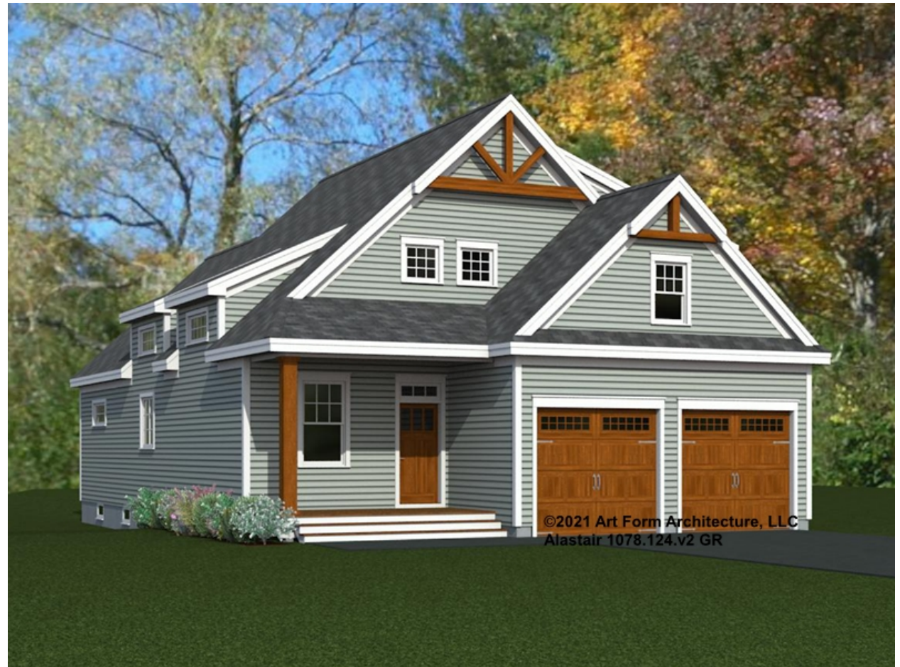
Alastair 1078.124.v2 GR

Art Form Architecture, LLC ("Artform") requires that our Drawings be built substantially as designed. Artform will not be obligated by or liable for use of this design with markups as part of any builder agreement. While we attempt to accommodate where possible and reasonable, and where the changes do not denigrate our design, any and all changes to Drawings must be approved in writing by Artform. It is recommended that you have your Drawing updated by Artform prior to attaching any Drawing to any builder agreement. Artform shall not be responsible for the misuse of or unauthorized alterations to any of its Drawings.