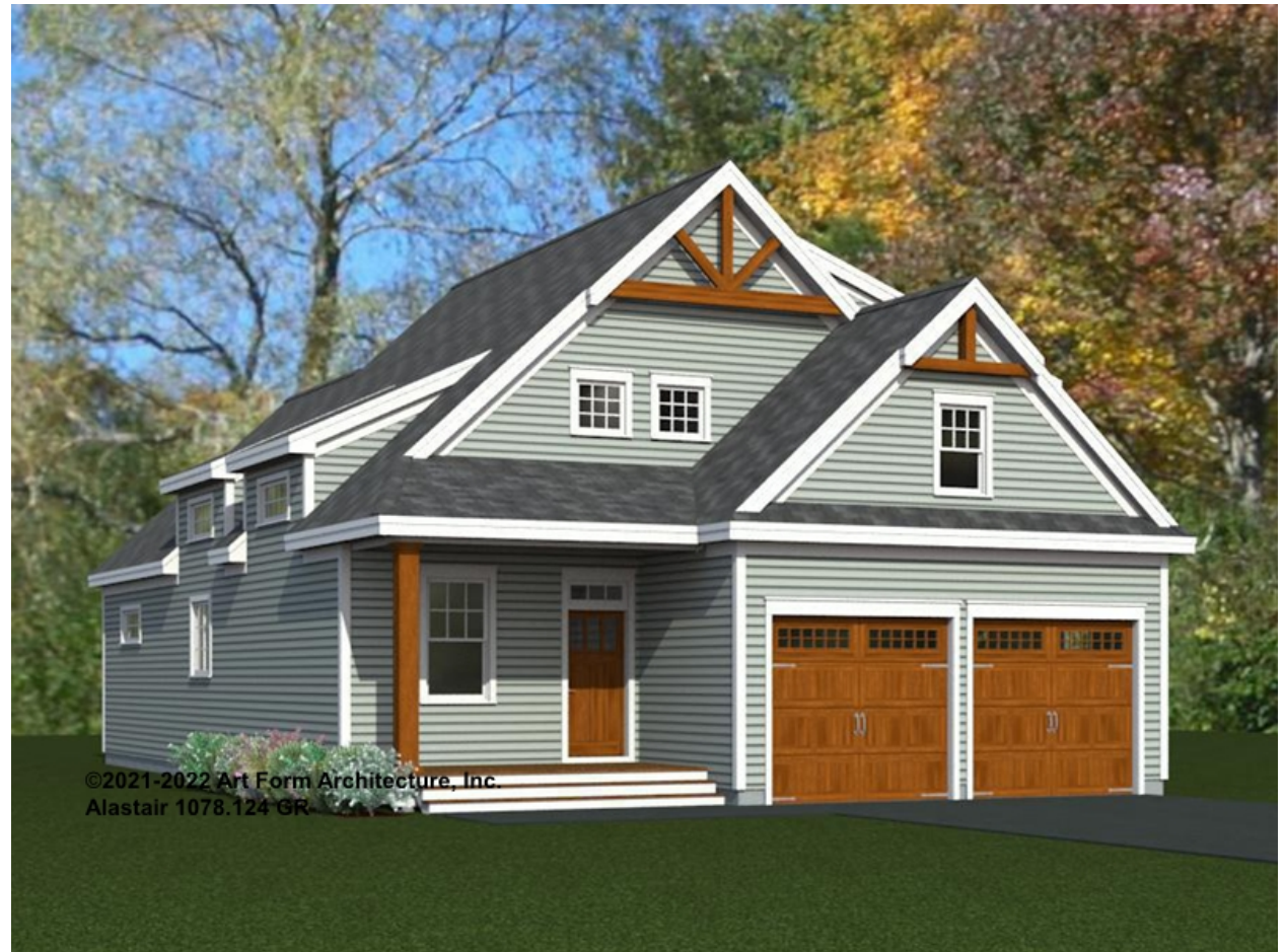
Alastair 1078.124 GR

Art Form Architecture, LLC ("Artform") requires that our Drawings be built substantially as designed. Artform will not be obligated by or liable for use of this design with markups as part of any builder agreement. While we attempt to accommodate where possible and reasonable, and where the changes do not denigrate our design, any and all changes to Drawings must be approved in writing by Artform. It is recommended that you have your Drawing updated by Artform prior to attaching any Drawing to any builder agreement. Artform shall not be responsible for the misuse of or unauthorized alterations to any of its Drawings.