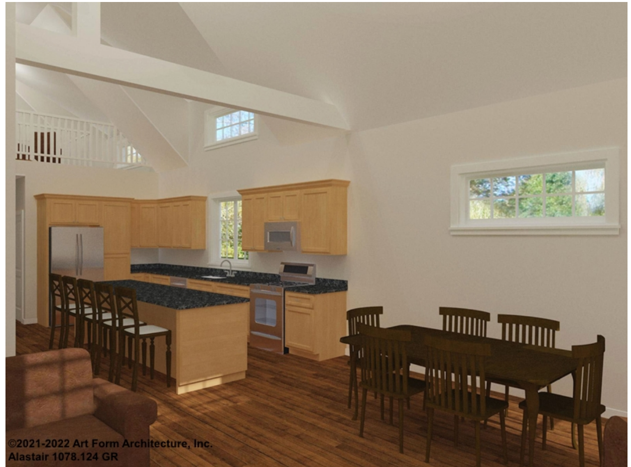
Living to Kitchen & Dining - Additional Image

Some features shown are optional. Your Purchase & Sale Agreement governs, whether items are labeled "optional" in this document or not.